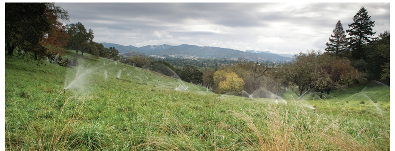
The authority uses sprinklers and drip irrigation to spread effluent throughout a natural treatment system for nutrient removal.

some forested and grass land. Effluent from the wastewater treatment plant is pumped through the wetlands to the pond, and then pumped up the hill-sides where it is applied to the land through sprinklers and drip irrigation.