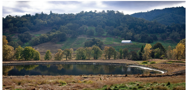
The effluent pond in the natural treatment system will be shaded by floating solar panels to reduce the heat the pond absorbs from the sun. They will also help power the system's pumps.