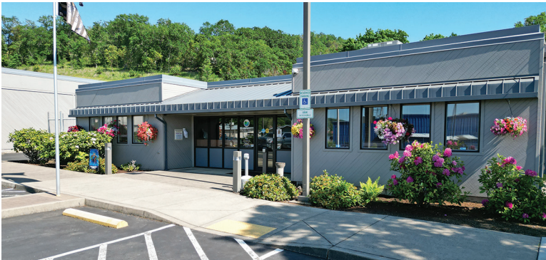
A ground-based solar array will provide all the power to operate the administrative office building at the Roseburg Urban Sanitary Authority.

“Based on some of the available funding sources, these solar projects quickly moved to the top of the pile. Even in the Pacific Northwest, we’re getting to that point where we may not have all the energy we’d like to have. If we can be better stewards and do some sort of on-site generation, we’re part of that effort to make a more resilient energy community.” tpo